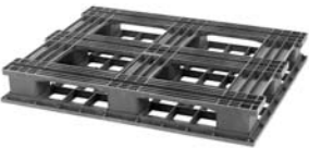
> 6 runners (6R)