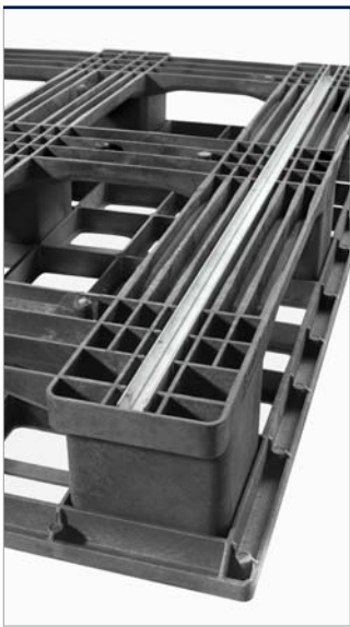
As option: metal reinforced runners