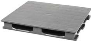
> closed deck (CD)