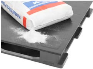
Dry bulk goods can not trickle through.