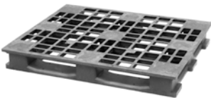
> open deck (OD)