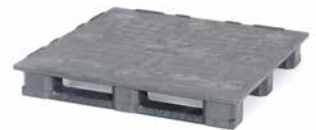
> closed deck (CD)