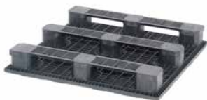
> 3 runners (3R)