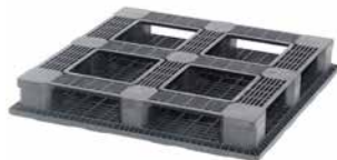
> 6 runners (6R)