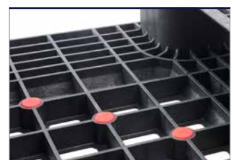
Available with up to 12 anti-slip pads