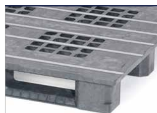
anti-slip strips (optional)