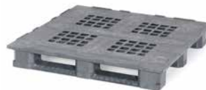
> open deck (OD)