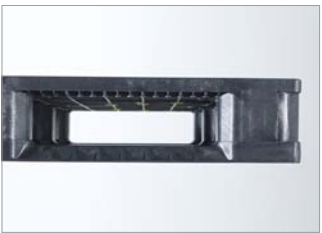
extra wide opening