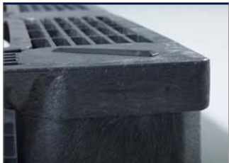
rubber inserts under blocks