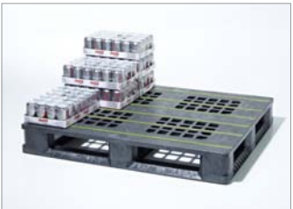
anti-slip strips on deck