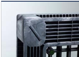
rubber inserts under blocks