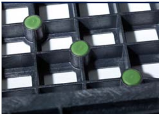
grommets under deck